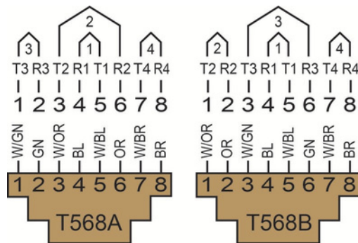
Figure 1: Wiring Schemes